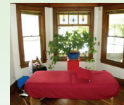
Restful and rejuvenating Healing Areas